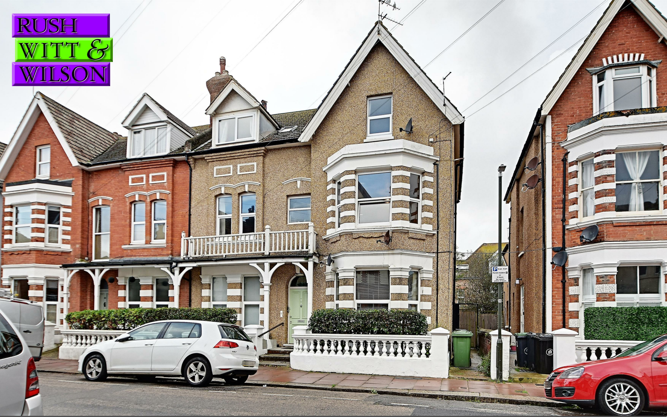
Flat 2, 12 Albert Road, Bexhill-On-Sea, East Sussex TN40 1DG £172,500